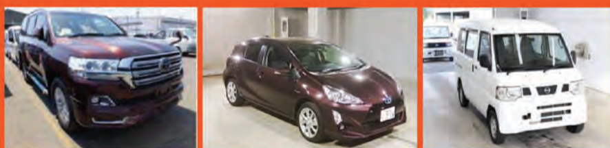
Land Cruiser 2016 Aqua 2016 Nissan Clipper 2013