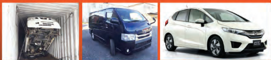
Nissan Clipper 2013 Hiacevan KDH Honda-Fit-Hybrid-White